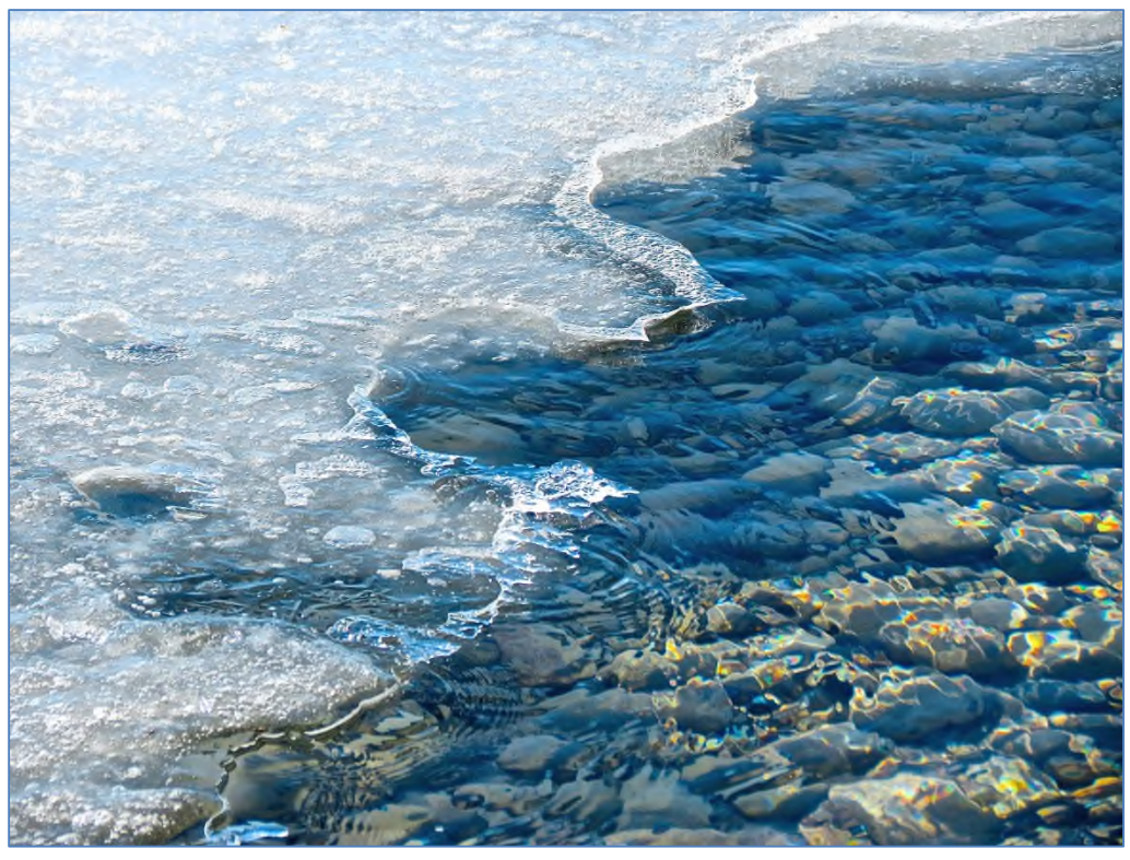
How did Bonnie Sitter get tropical blue shimmering water in this early April shoreline shot?