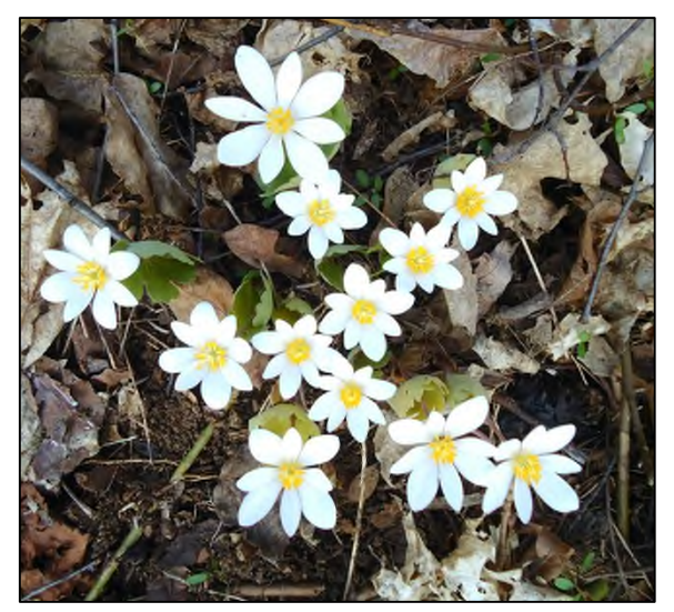
Bloodroot plants were blooming in Exeter by April 24, as shown in this Bonnie Sitter photograph.