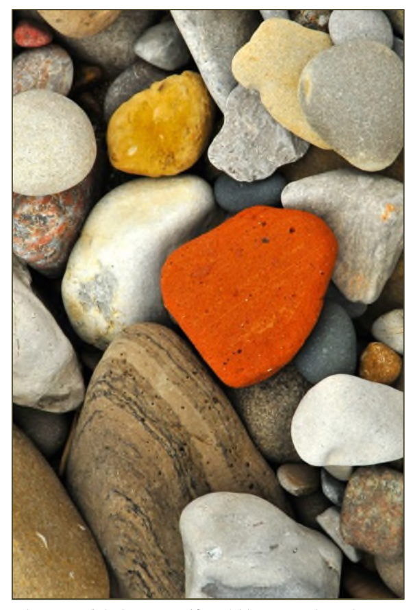
What you might have seen if you'd been out along the Lake Huron shoreline with Bonnie in late March.