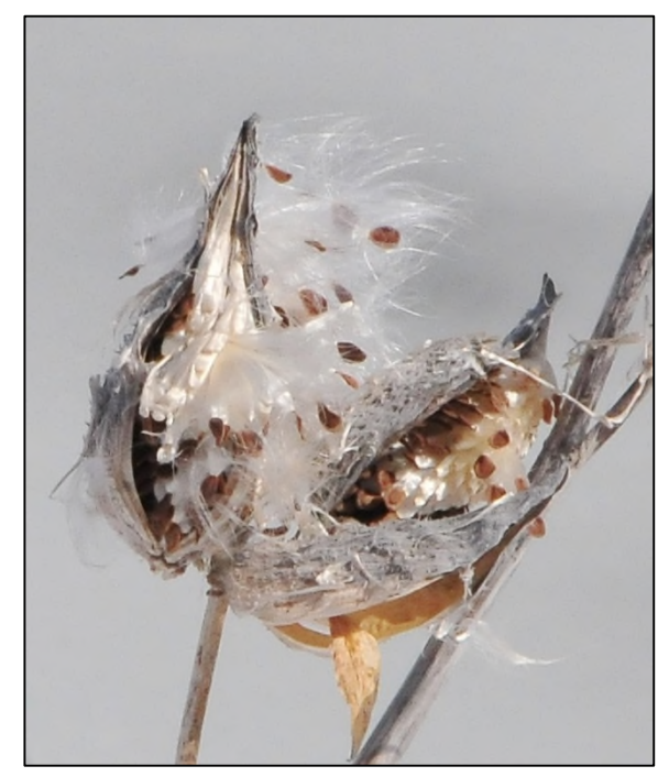
Perfect timing—this milkweed pod overwintered, then released its parachuted seeds near the end of March just as bare ground was making its appearance. Another great photo courtesy of Bonnie.