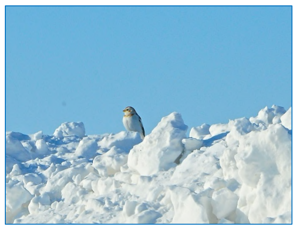
An obliging Snow Bunting posed for this Bonnie Sitter shot in early March.