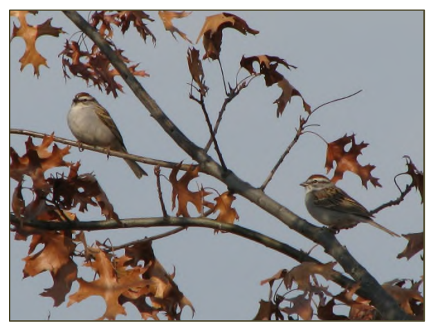
It looks like a fall photograph, but these Chipping Sparrows were new spring arrivals when Steve Thorpe took this photo.