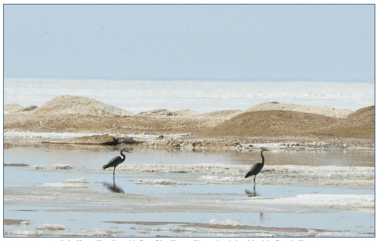
Lake Huron Shoreline with Great Blue Herons. Photo taken in late March by Bonnie Sitter.