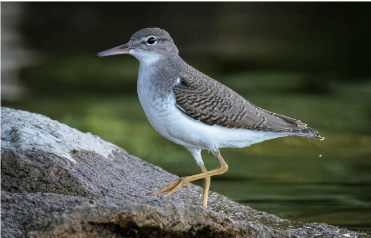
Spotted Sandpiper at Harrington: Herman Veenendaal.