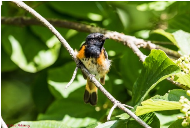
Northern Flicker, Red-eyed Vireo, Merlin Goldfinches, American Redstart.