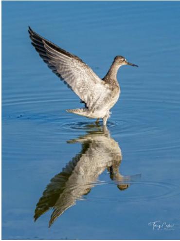
Lesser Yellowlegs at West Perth Wetlands: Terry Crabe