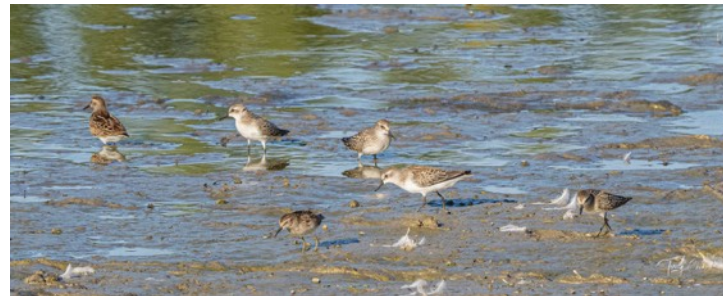
Lesser Yellowlegs, Semipalmated Sandpipers & Least Sandpipers.