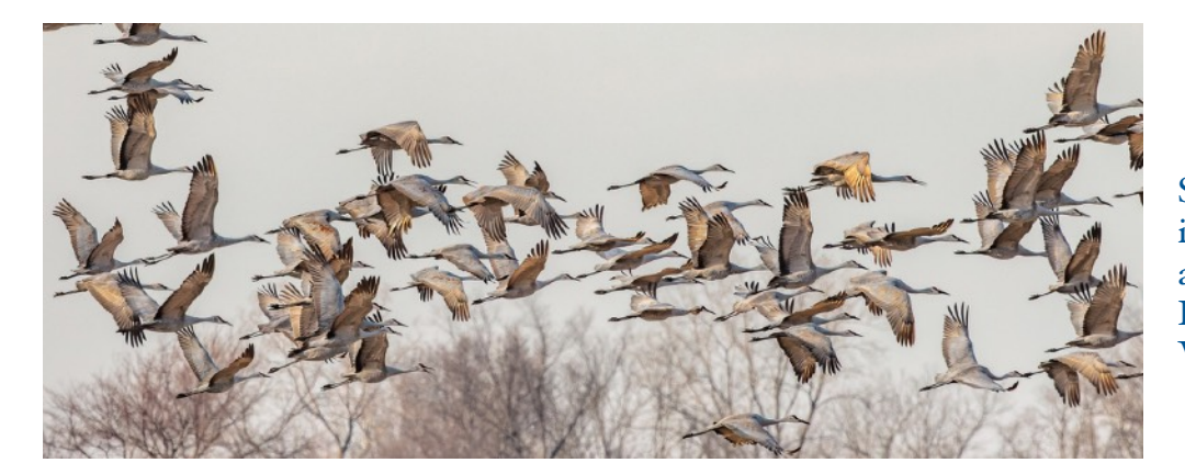
Sandhill Cranes in December 13 at Long Point: Herman Veenendaal