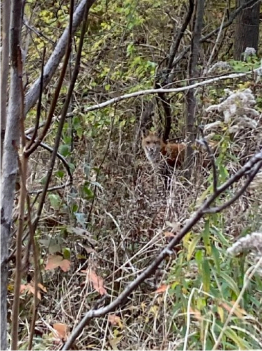
Claire Bickley: Fox incognito in the Dolan