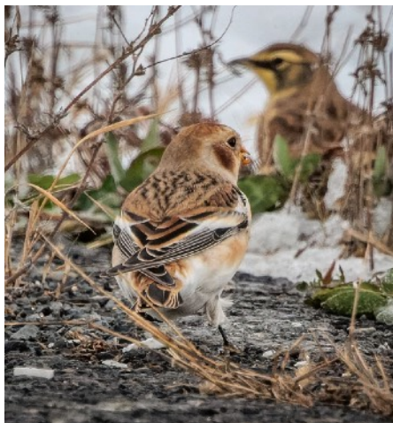
Snow Bunting and Horned Lark.