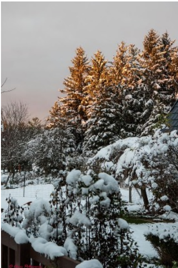
Sunset Trees November 14, 2022: Chris Polkiewicz